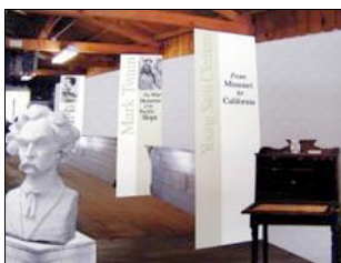
This graphic illustration shows the museum's vision for its Mark Twain exhibit.